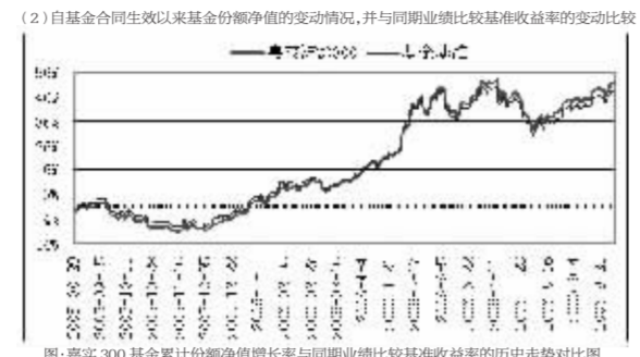
图 1: 嘉实沪深 300 指数证券投资基金净值增长率与同期业绩比较基准收益率的历史走势对比图